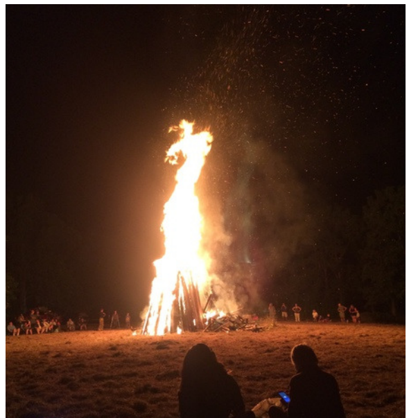
Bonfire at Bare Hill.

September 12— Hike in the Village. Due to the inclement weather, only two VHT board members toured around the Village and over to Victor Municipal Park. But in spite of the weather, VHT was at Hang Around Victor Day and talked to many people about our trails.