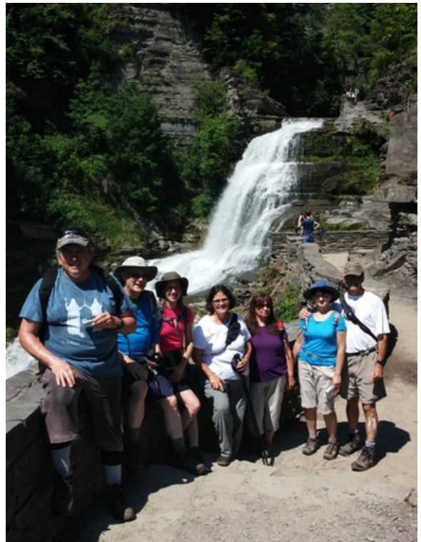
Robert H. Treman State Park.

September 5— Ring of Fire at Bare Hill. Eighteen folks from the Victor and Penfield areas drove to Bare Hill and hiked to the summit for the traditional bonfire at 9:00 P.M.